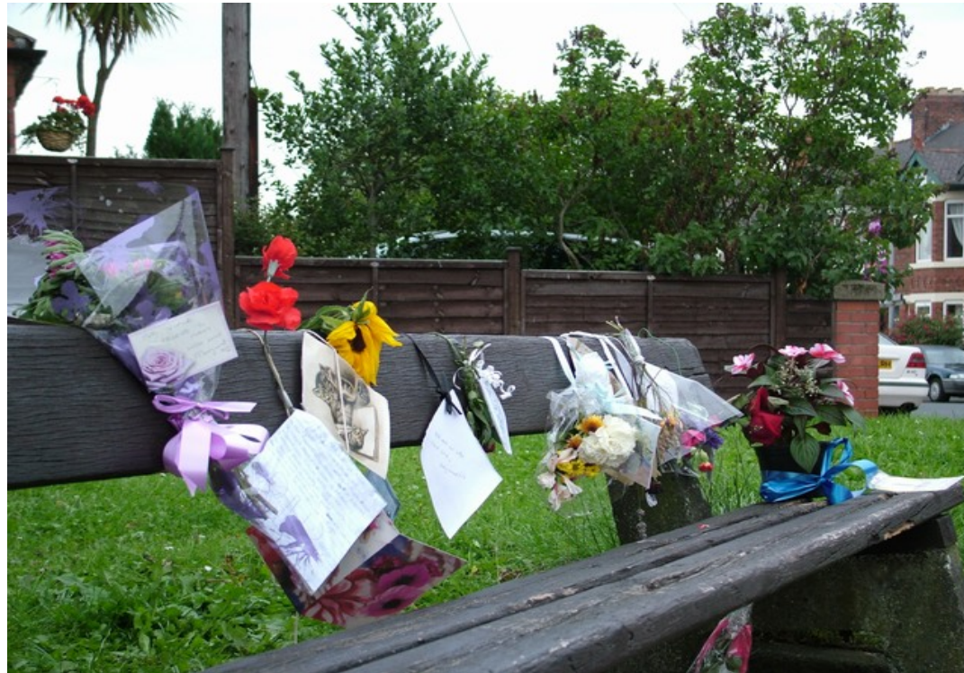
Morgan Centre for the Study of Relationships and Personal Life